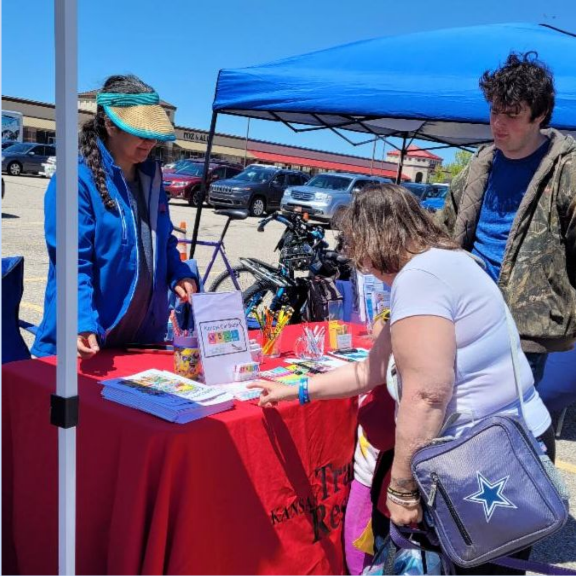
Traffic Safety Event at Haskell Indian Nations University